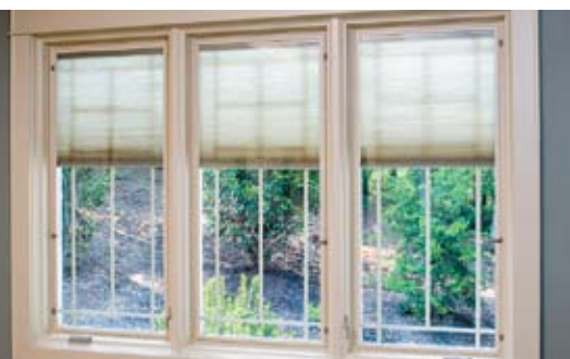
Pella Designer Series casement windows with snap-in between-the-glass shades and prairie grilles.

You've already experienced how Normandy Builders creates more beautiful, comfortable and energy-efficient homes for our customers. So if you're considering window and door replacement, think of us. We're proud to have a 30-year partnership with Pella — an industry leader in window and door innovation. For more information on window and door replacement from Normandy Builders, call 630-455-5600. ■