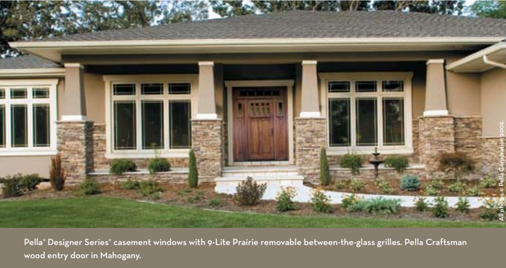
Pella® Designer Series® casement windows with 9-Lite Prairie removable between-the-glass grilles. Pella Craftsman wood entry door in Mahogany.