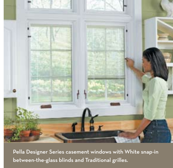
Pella Designer Series casement windows with White snap-in between-the-glass blinds and Traditional grilles.

Windows are not only your home's source of natural light and ventilation. Quality windows can make a huge difference in other important parts of your life — everything from impressing guests ... to how you spend your free time ... to even the size of your energy bills. In fact, here are seven great reasons new windows from Normandy Builders will make every day a little brighter.